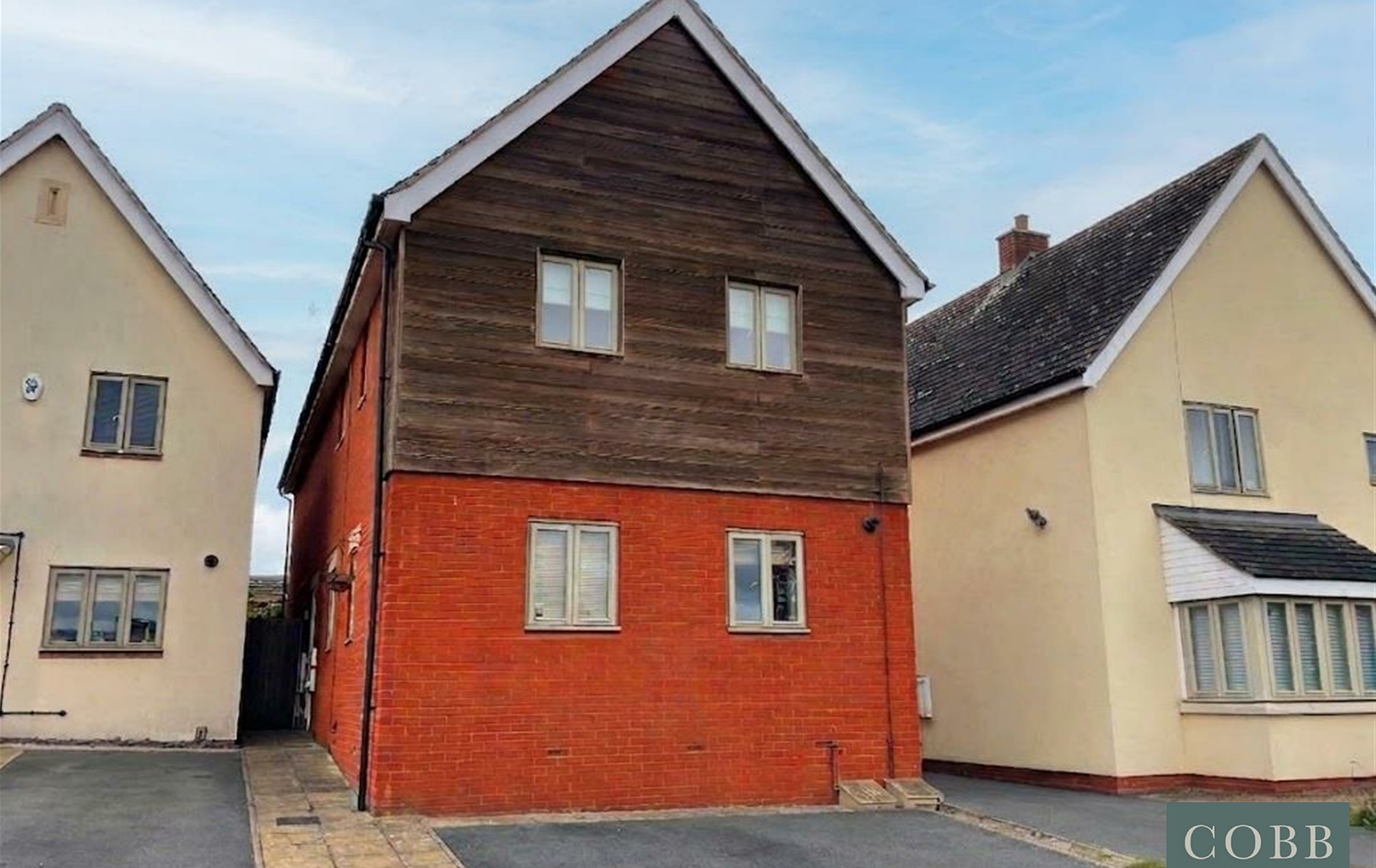
2, Campbell Road, Hereford, HR1 1AD Price £162,500

COBB AMOS SALES | LETTINGS | AUCTIONS LAND & NEW HOMES